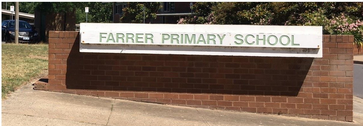
Farrer Primary School